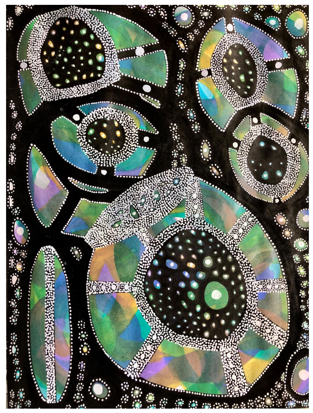
"Dogon/Sirius B Nommo/Ancestors" series