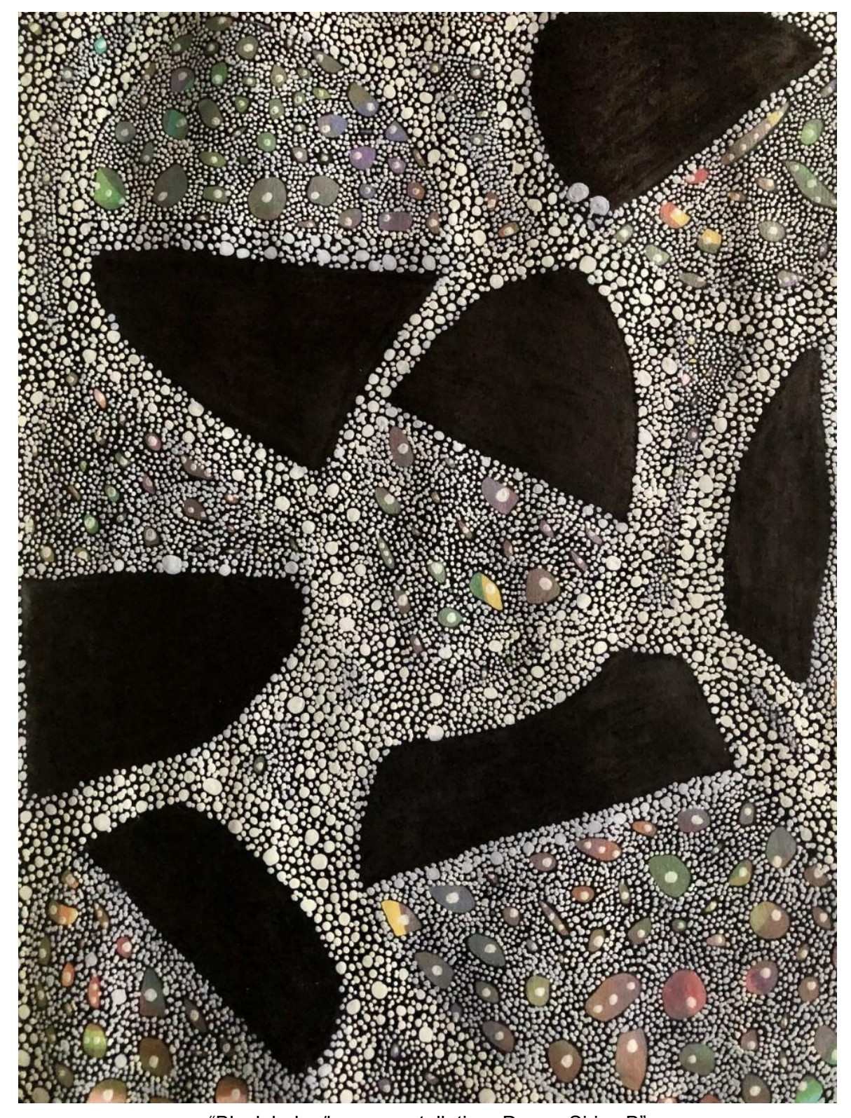
"Black holes/boss constellation- Dogon Sirius B"